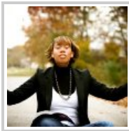
Healing from Brokenness | Bronze Magazine